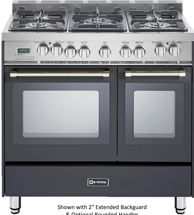
Shown with 2" Extended Backguard & Optional Rounded Handles