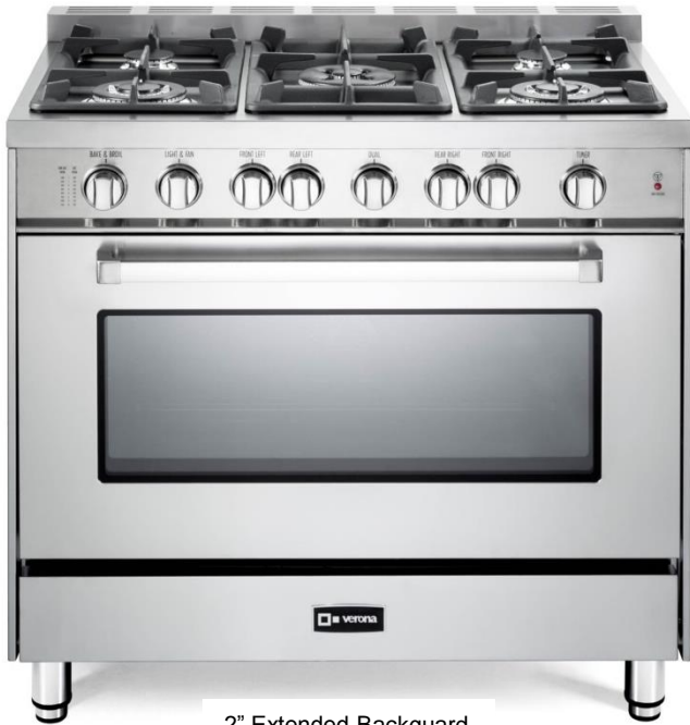
2" Extended Backguard