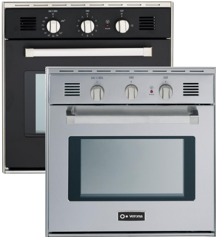
VEBIG24SS - Stainless Steel VEBIG24E - Matte Black